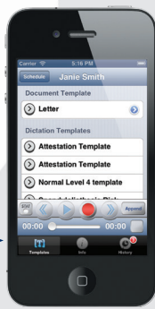
SELECT DOCUMENT AND/OR DICTATION TEMPLATE